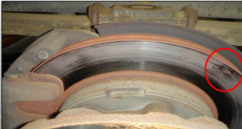
Heavy transfer on 2 sides of rotor, face missing material. Warrantable-covered as collateral damage from caliper