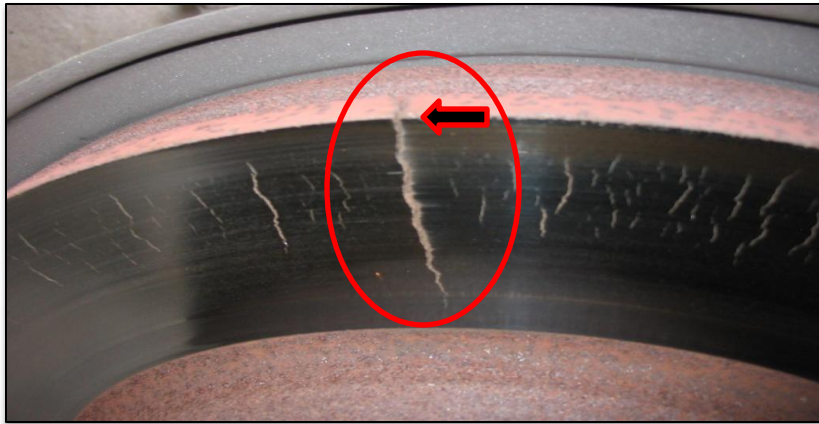
Radial crack into cooling fin w/o transfer-Non warrantable